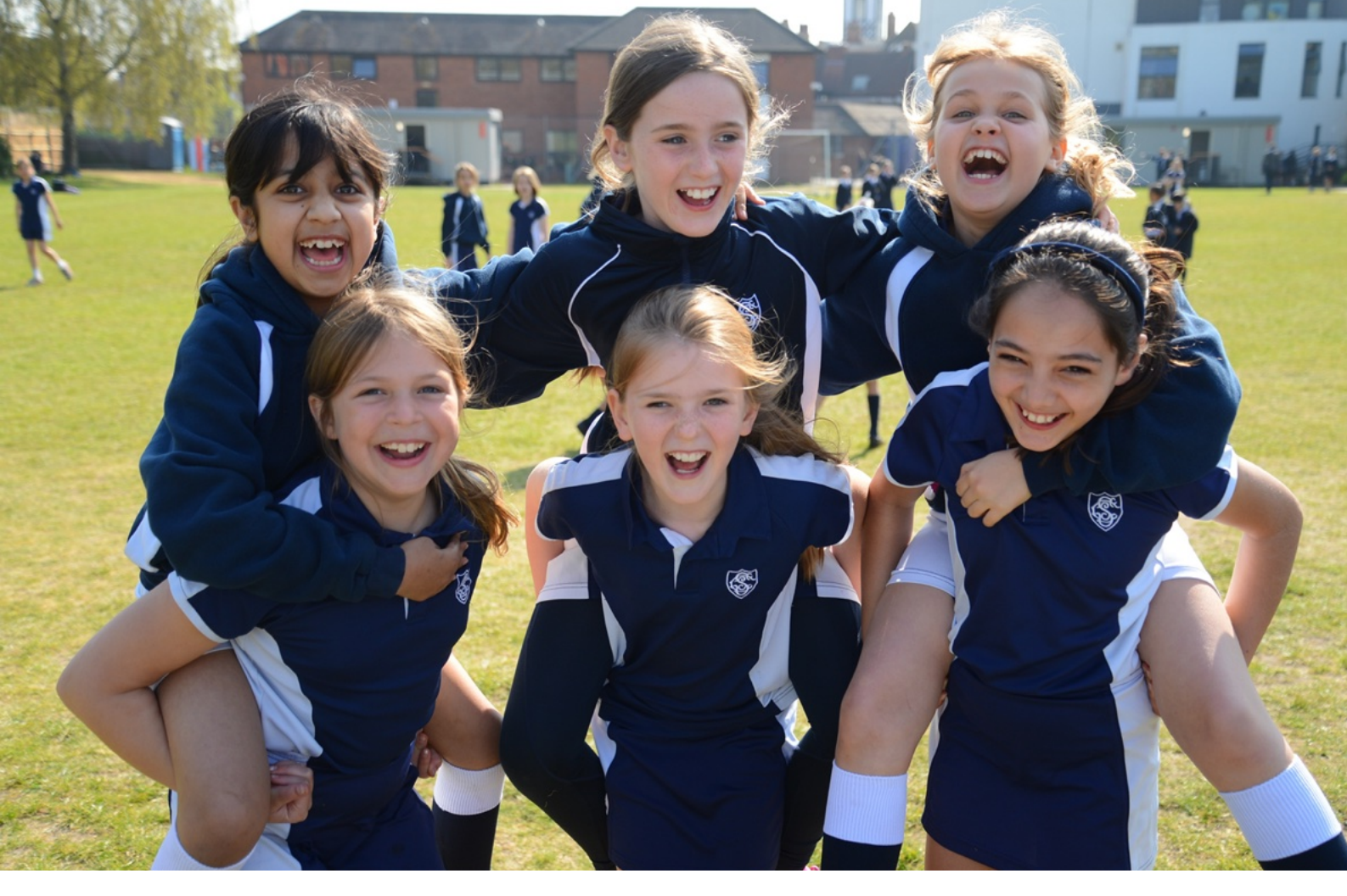
The girls and staff at St Catherine's look forward to meeting you soon.