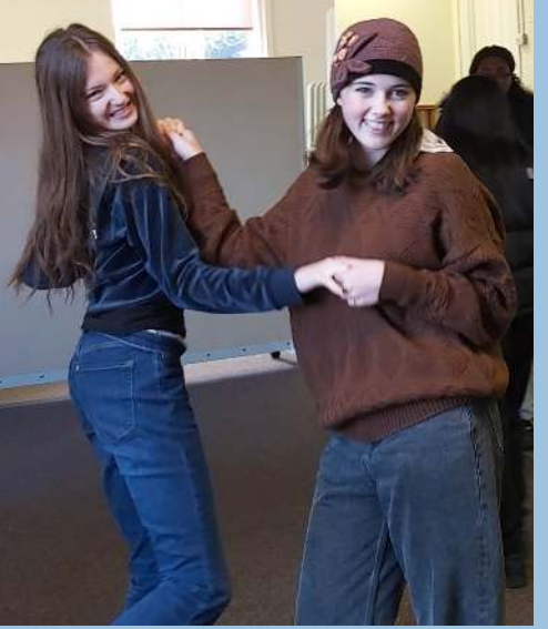
"Year 11 were a delight to be with and thoroughly enjoyed the day"