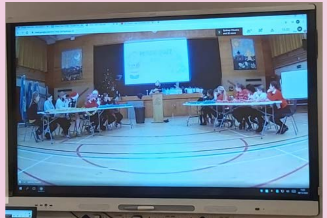
Remote House Quiz

Our annual House Quiz went ahead on Wednesday, this year in a remote format so that we could maintain social distancing. It was terrific to see the girls supporting their House teams, while the staff round was hotly contested as usual. After all six rounds were completed, Cavell emerged victorious, followed by Bronte, who took second place. Well done to everyone who took part, and thank you to the Head Girl Team for setting this year's questions.