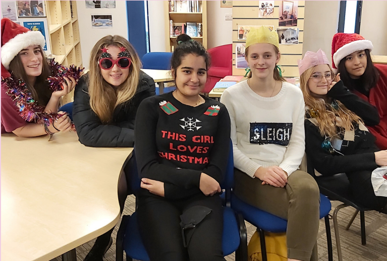
House Quiz: Bronte Bubble 5

On Wednesday, 9 December the whole school came in wearing their best Christmas jumpers, in return for charity donations to Richmond Food Bank and Richmond Christmas Day Dinner. It was so much fun to see everyone in their festive best!