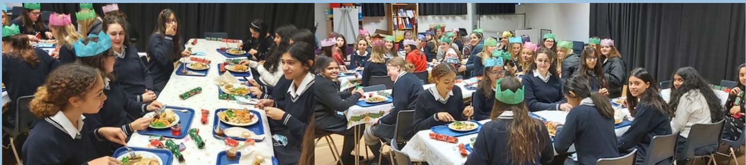
Year 11 Christmas lunch